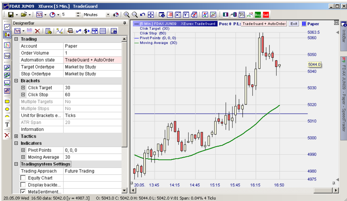
Picture 1: Each chart contains a DesignerBar that allows to view and modify all settings concerning trading and charting. To save screen space the DesignerBar can be rolled in.