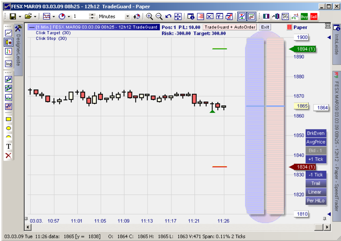
Picture 4: After opening a position the TradeGuard placed a profit target order and a stop loss order to protect the position. By clicking on the slider the available Tactics are shown. A Tactic can then be executed by clicking on it.